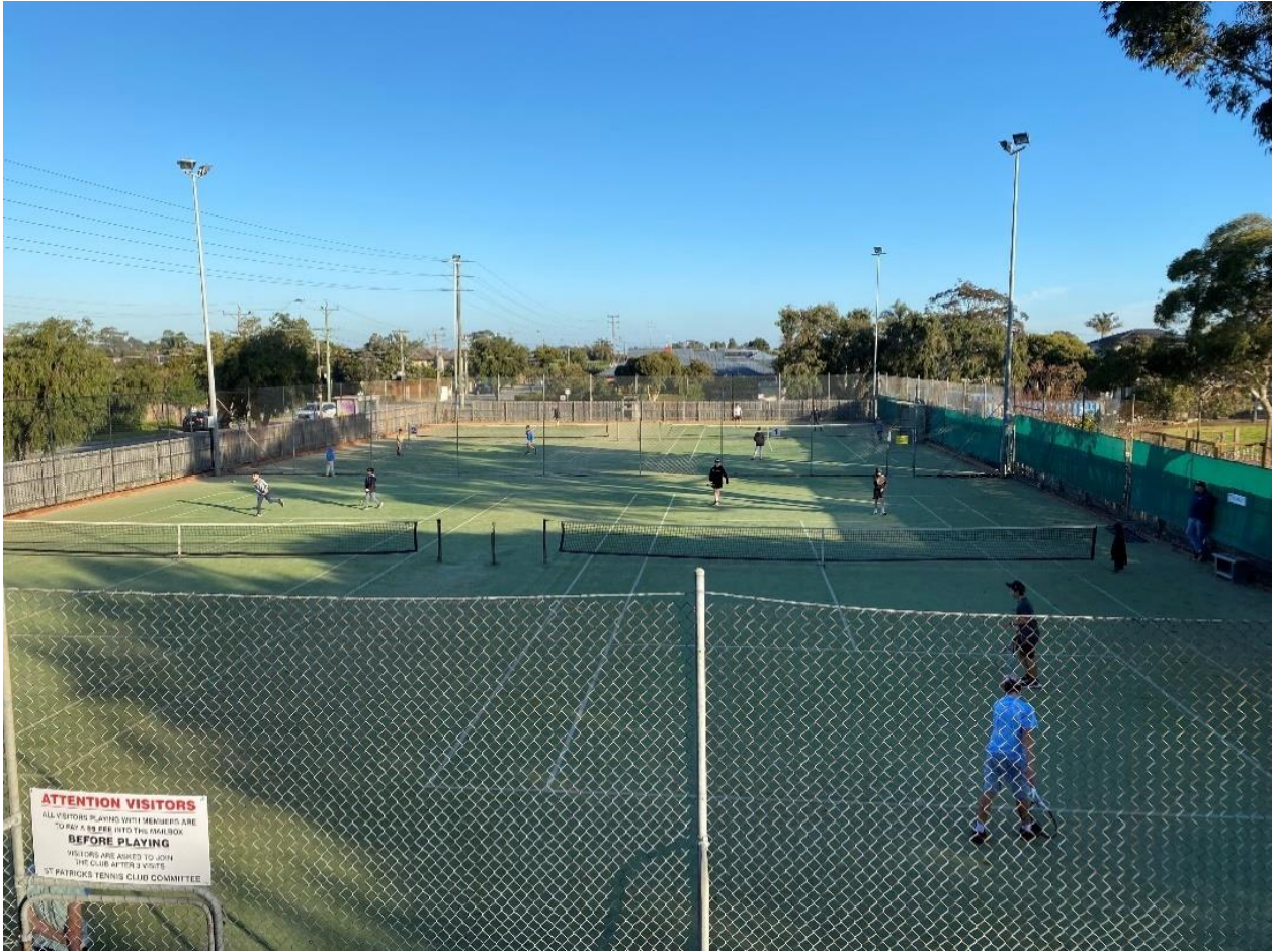
St Patrick's Junior welcome BBQ