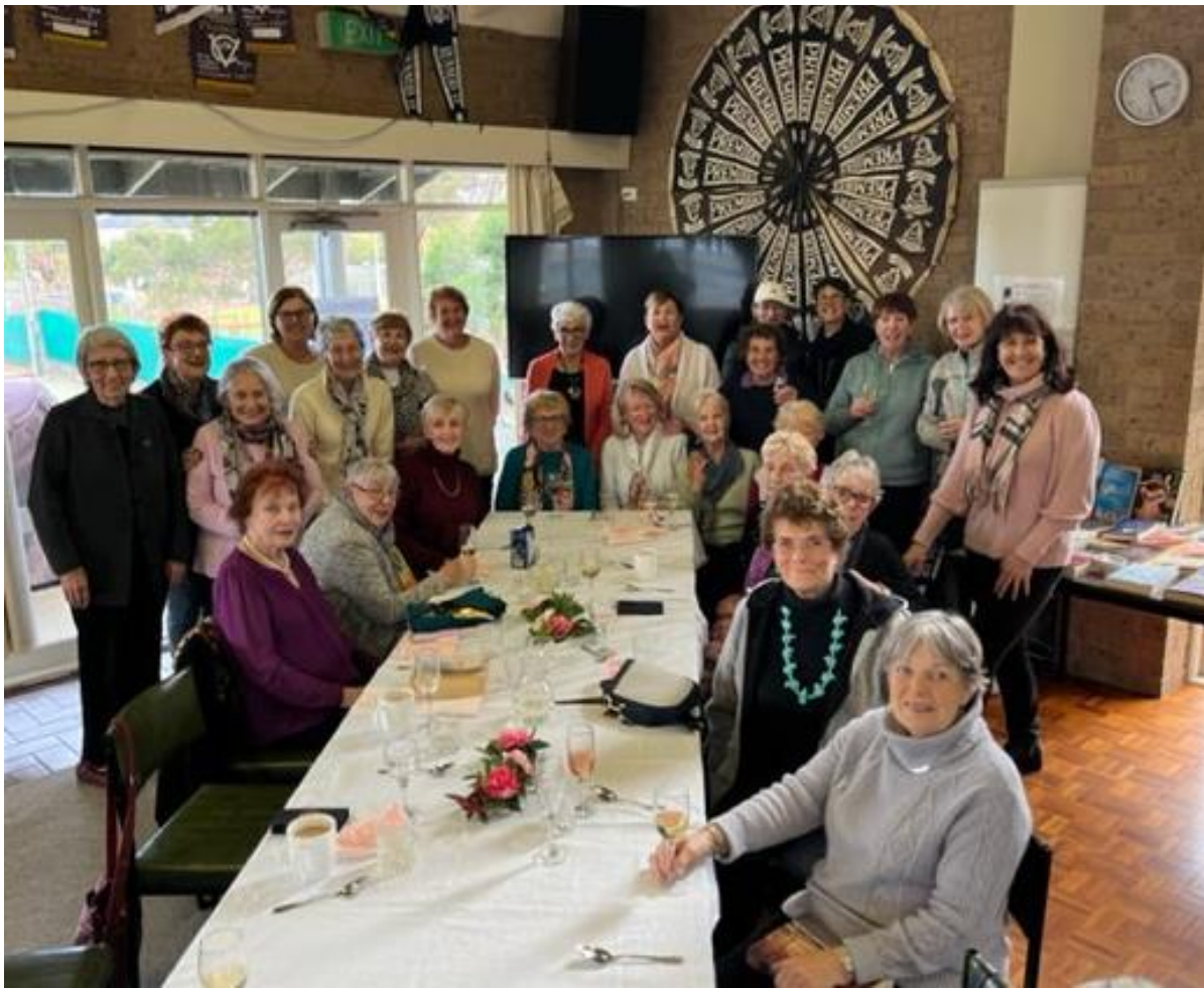
Our mid-year Ladies Lunch 2022