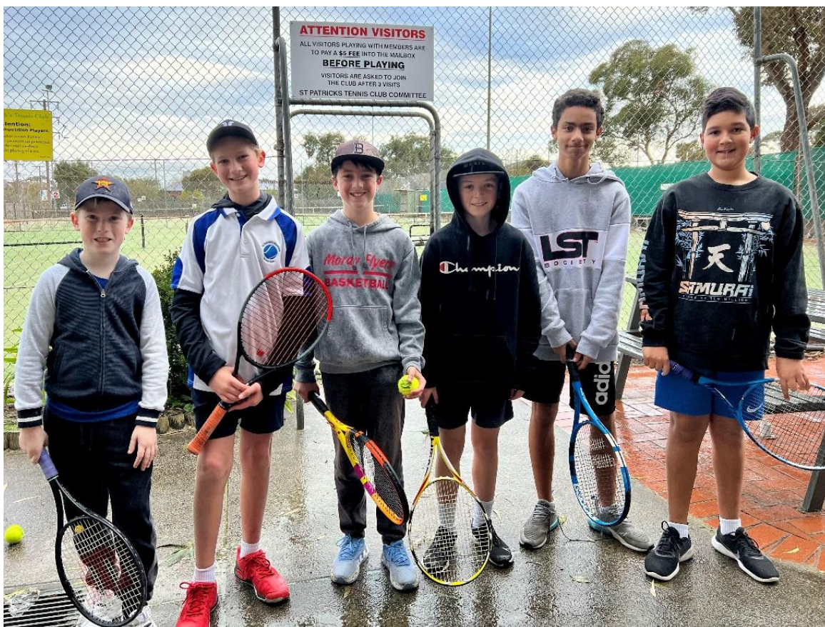
Section 18 St Patrick's Junior team